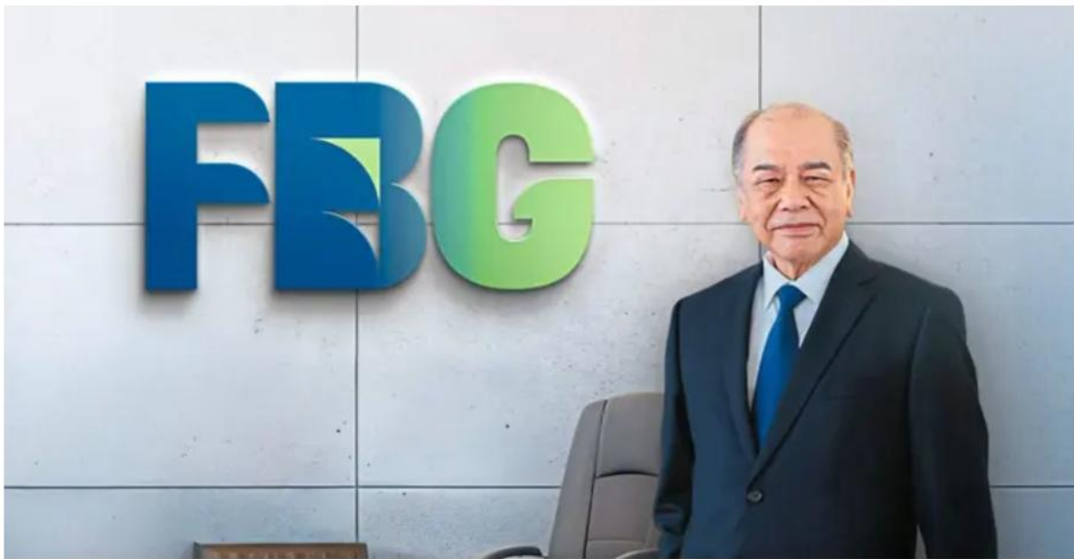
Fajarbaru group executive chairman Tan Sri Chan Kong Choy